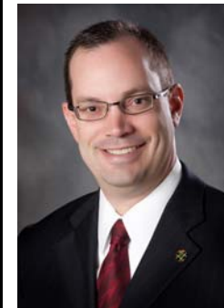
Kevin J. Martin